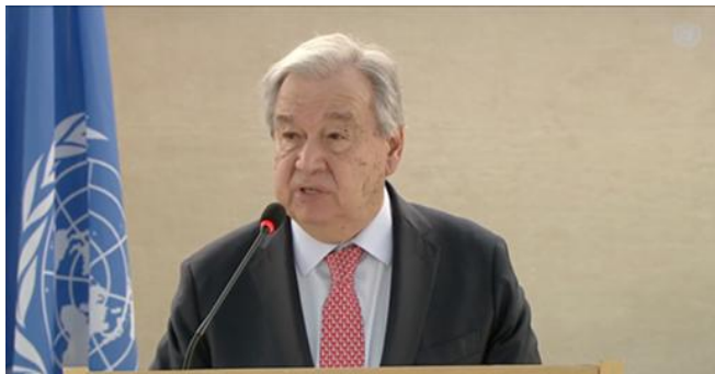
UN Secretary-General António Guterres gives his opening remarks during the 58th session of the Human Rights Council.