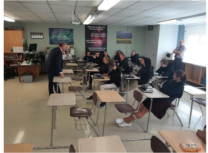
CCI presentation at Calvin Christian School Coalhurst, AB