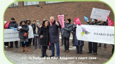
CCI in Finland at Päivi Räsänen's court case